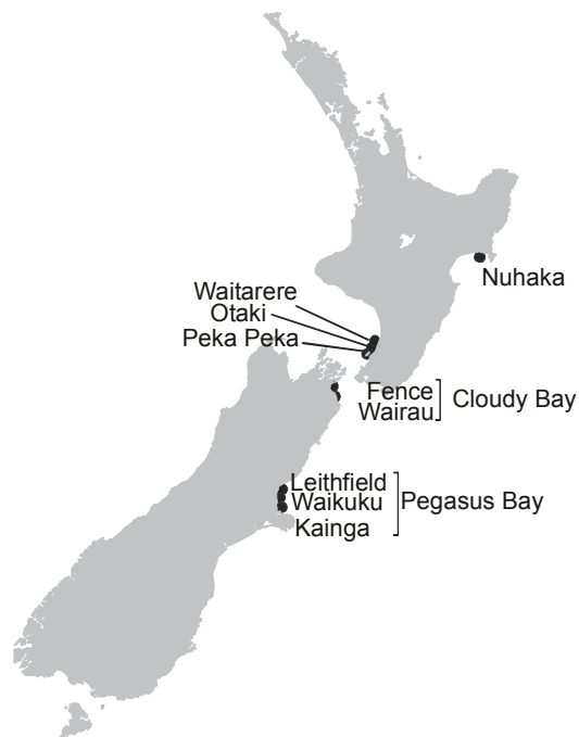
Figure 2: Location of sites surveyed.