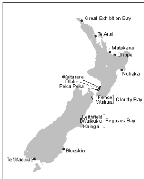
Figure 1: Location of sites surveyed.