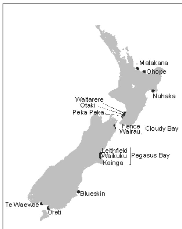
Figure 2: Location of sites surveyed.