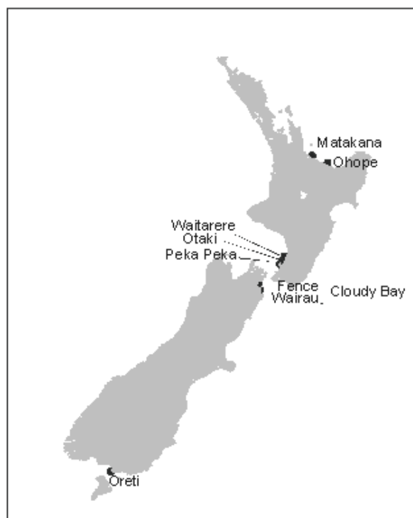
Figure 2: Location of sites surveyed.