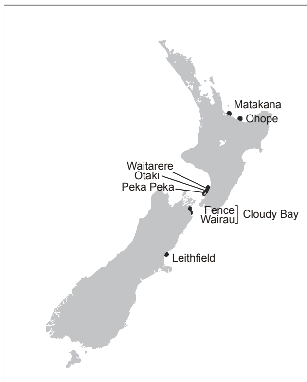
Figure 1: Location of sites surveyed.

† Assumes that these species related to D. anus and living in the same part of the surf zone will be similar and F_{0.1} can be used as a substitute.