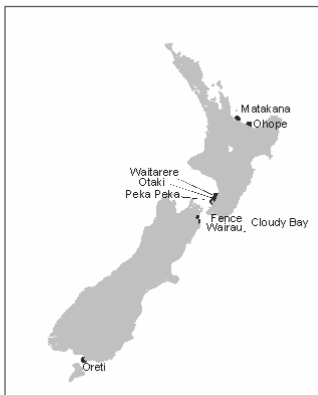
Figure 1: Location of sites surveyed.