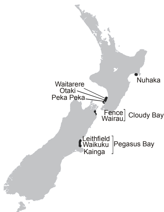
Figure 1: Location of sites surveyed.